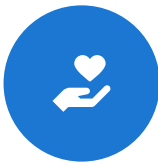
Full Funnel Measurement